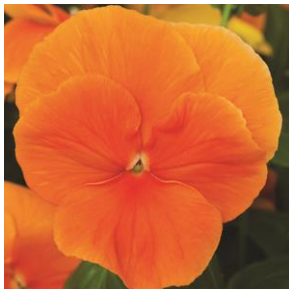
Pansy Delta Premium Pure Deep Orange

Pure deep orange color with a fine cream white creased edge and a small cream white eye. Early and persistent growth. Does well even in low light situations. Dark green leaves. Shows best in a mass planting, but is adapted to all uses for pansies or violas.