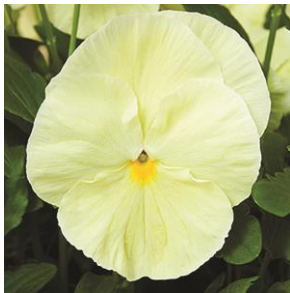
Pansy Delta Premium Pure Primrose

Pure pale primrose yellow with a tiny golden eye. 3-inch flower. Very heat and cold tolerant with blooms held upright. Considered to be a giant hybrid Viola.