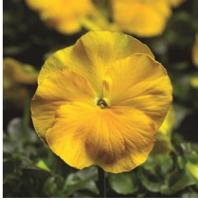
Pansy Delta Premium Pure Yellow

Clear golden tyellow 3 inch flower. Mixes well with Pure Orange and Pure White for a bright mix with large flowers.