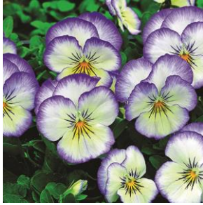
Viola Penny Purple Picotee

Fast growth rate, excellent root system. Excellent heat tolerance. Fragrant soft ivory flowers with black whiskers and lavender picotee marginal edging with a yellow eye.