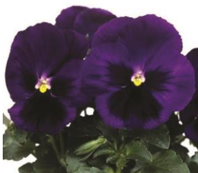
Pansy Majestic Giants II Deep Blue Blotch

Purple with a soft, very large black blotch and a tiny yellow eye. Hardy to -10 degrees.