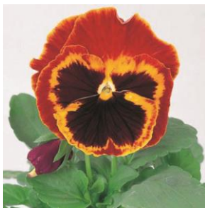
Pansy Majestic Giants II Fire

Mahogany-red flower with a yellow and brown face. Some flowers will not have the mahogany-red outside margin. Mixes beautifully with Majestic Giants II Clear Yellow. Extra-large flowers.