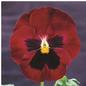
Pansy Majestic Giants II Rose Blotch

Rose-pink flower with a purple blotch and white eye with a yellow dot. There is a variation in color from dark rose-maroon to lighter almost rose-pink within the flowers. The white eye is prominent. A very attractive flower.