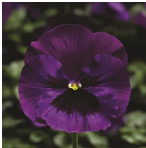
Pansy Delta Premium Neon Violet

Deep violet flower with a Neon Blue face and a Violet Black blotch. Flower grows to 2.5 - 3 inches.