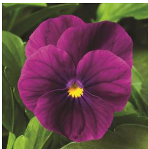
Viola Penny Violet

Fragrant ultra violet flowers with a tiny notched yellow eye. There is some lighter purple shading to the outside of the margins.