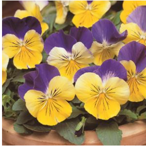
Pansy Matrix Morpheus

Hardy to cold temperatures. This particular variety will not flower as much in autumn, but will grow through winter with slow flowering and will burst forth in spring for a long stay until April, with high flowering.