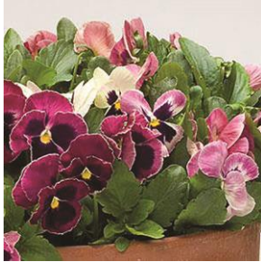
Pansy Majestic Giants II Girlfriend Mix

Mixed colors ranging from maroon to pink to cream white, all with a purple-black blotch.