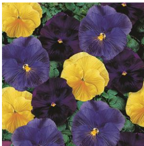
Pansy Delta Tri-Color Mix

Clear Purple Violet, Clear Light Purple-Blue, and Yellow with a golden yellow blotch mixed. Vibrant mix of colors.