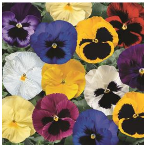
Pansy Delta Premium Mix

At least 4 colors, some clear and some blotched, in purple, yellow, red and white with shadings of lavender, blue, primrose and pink.