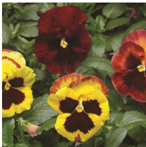
Pansy Karma Copperfield

Large blooms with a variety of colors ranging from maroon with a black blotch to yellow with orange-red around the petal margin with a black blotch. Beautiful warm shades mix which look coppery-red from a distance.