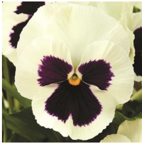
Pansy Delta Premium White Blotch

Slightly ruffled pure cream-white 2.5- to 3-inch flower with a purple-black blotch.